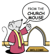
FROM THE CHURCH MOUSE

Would you like to try out some new dishes during these long winter days that are ahead? Buy one of our new church cookbooks containing mouth-watering recipes from current and past members of our congregation. Check them out on the table in the Gathering Room. The cost is only $18.00.