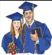
Meet Our Graduates