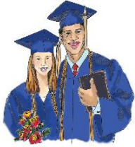
Meet Our Graduates